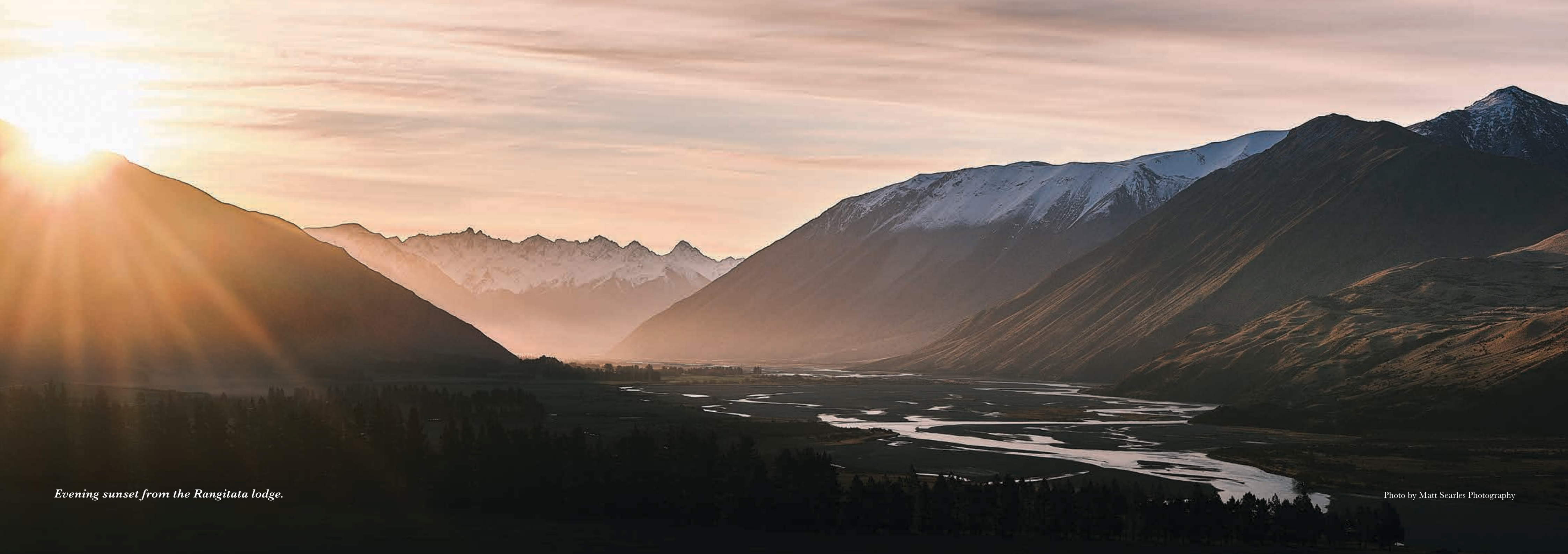
Evening sunset from the Rangitata lodge.